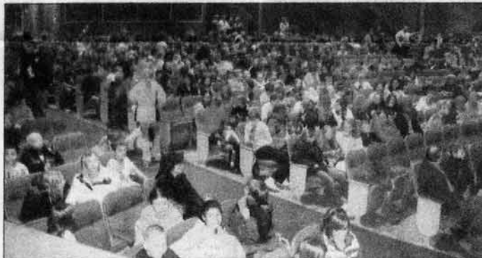
Students from around the Sauk Centre area attended a matinee showing Thursday in the Sauk Centre Public School Auditorium.

Knowing his own state's 150th anniversary was coming up he ventured through poetry, music, skits and old pictures to bring the story of Minnesota alive. It was 2004, in his home town, that the first performance took place. While the Minnesota performances in the early going were presented in auditoriums in the major cities and the Minnesota State Fair, this 150th year has seen traveling to smaller communities such as Sauk Centre, with showings to grade schoolers and adults alike.