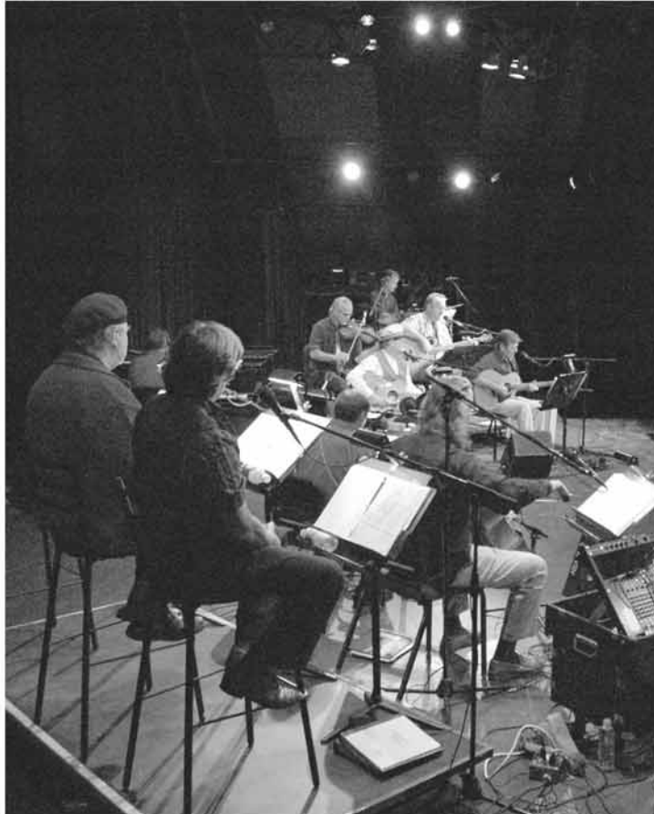
Members of Big Top Chautauqua perform before a sellout crowd in the 200-seat grand hall of the Windhover Center for the Arts Friday night. The bluegrass group, which has a 10 p.m. Saturday Wisconsin Public Radio show, made its first appearance in Fond du Lac.