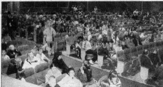
Students from around the Sauk Centre area attended a matinee showing Thursday in the Sauk Centre Public School Auditorium.

Knowing his own state's 150th anniversary was coming up he ventured through poetry, music, skits and old pictures to bring the story of Minnesota alive. It was 2004, in his home town, that the first performance took place. While the Minnesota performances in the early going were presented in auditoriums in the major cities and the Minnesota State Fair, this 150th year has seen traveling to smaller communities such as Sauk Centre, with showings to grade schoolers and adults alike.