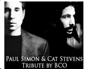
PAUL SIMON & CAT STEVENS TRIBUTE BY BCO

Our own Blue Canvas Orchestra performs the songs of two of their favorite singer/songwriters and artists: Paul Simon and Cat Stevens. Some of Paul's most memorable hits include "The Boxer," "Bridge over Troubled Water," "Diamonds on the Soles of her Shoes." Cat Stevens, who has since changed his name to Yusef Islam, is celebrated for the songs of an era including "Moon Shadow," "Peace Train," "Wild World," and "Oh Very Young."